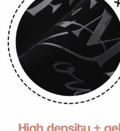
High density + gel