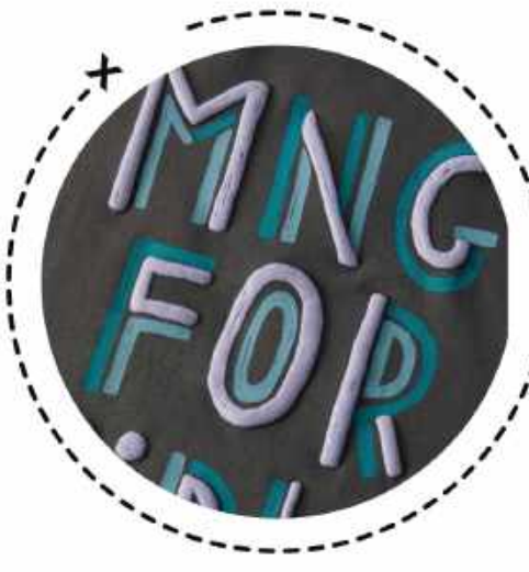
Aqueous bases + Puff